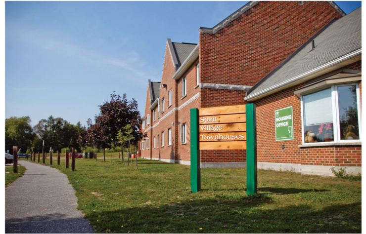
Pictured above is the outside of the Spirit Village Townhouses. Each house has a full kitchen, that mature and returning students can use to prepare their own meals.