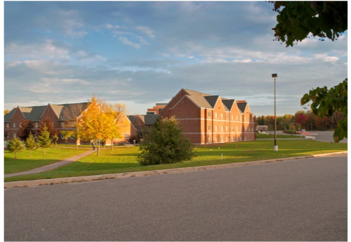
Pictured above is the Lou Lukenda Dormitory, for Canadian and International Students. With a kitchen located on the first floor, students can prepare their own food that embraces the diversity of this building.