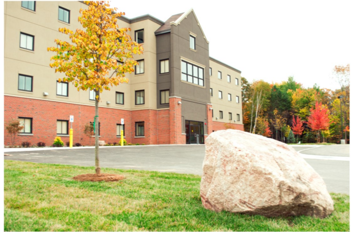
Pictured above is the New Dormitory, for students new from high school less than 16 months. Ideal for adjusting to University life along side other students.